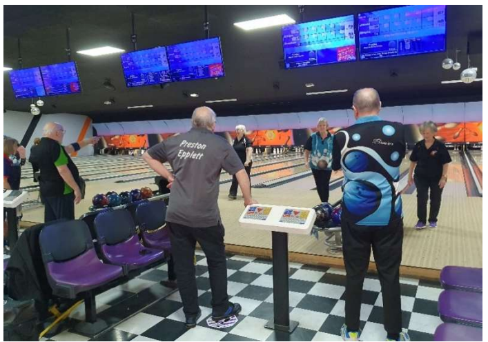
Photos from across the Lane